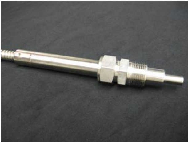
Figure 2 – GT1200-7FA Transducer Housing

Transducers - Davidson fiber optic pressure pulsation transducers are designed for installation in the turbine casing where the existing pressure outlet tubes are installed. The transducer housings are designed to be installed flush with the inner liner and are tolerant to moderate misalignment of the threaded hole in the casing and the drilled hole in the liner.