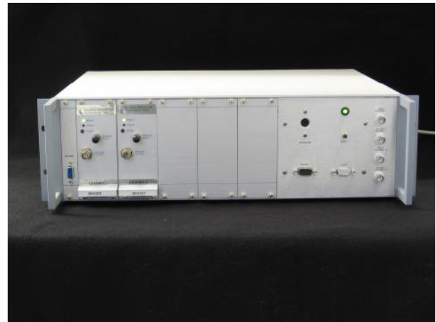
Dynamic High Frequency Response Signal Conditioner

This unit will interrogate up to sixteen sensors and is packaged in a 19" subrack. The standard output options are +/-5 Volt analog or digital over Ethernet.