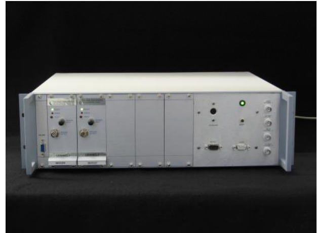
Absolute High Resolution Signal Conditioner

This unit may be configured with up to thirty-two (32) channels and may be ordered with a variety of outputs to interface with supervisory control systems.