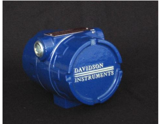
Absolute High Resolution 4.5" Explosion-Proof Signal Conditioner

The DSU2000 is an eight channel unit and may be multiplexed with any combination of Davidson static transducers including: pressure, temperature, load, and position. The unit can be ordered with a variety of outputs to interface with supervisory control systems.