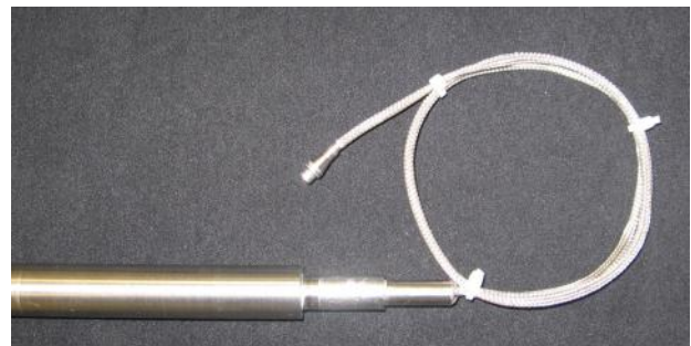
Figure 1 – GT1200-501 Transducer Housing

Transducers - Davidson fiber optic pressure pulsation transducers model GT1200 501 has a flexible probe and was designed for installation in the "J" tube along side the combustor basket. Installation does not require any modification to the engine. When fully inserted into the engine, the pressure diaphragm is located within ¼" of the end of the J-Tube making a direct measurement and minimizing distortion.