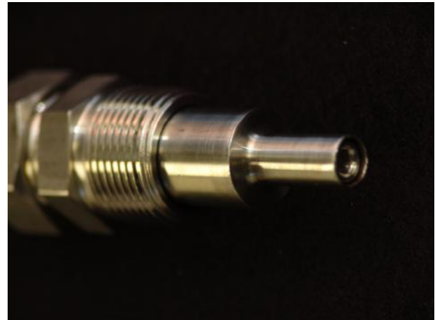
10 psi Transducers for Gas Turbine