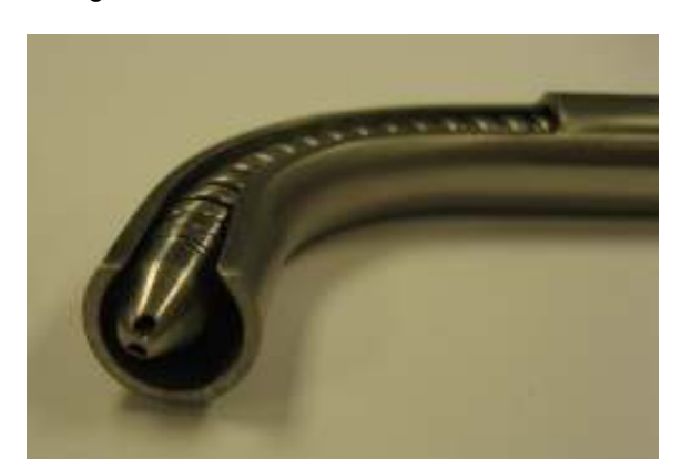
Figure 2 – GT1200-501 Transducer

Transducers - Davidson fiber optic pressure pulsation transducers are designed for installation through the "top hat" where the existing acoustic waveguides are located. The transducer design allows the sensor to be positioned flush with the combustion liner at the end of the existing acoustic waveguide.