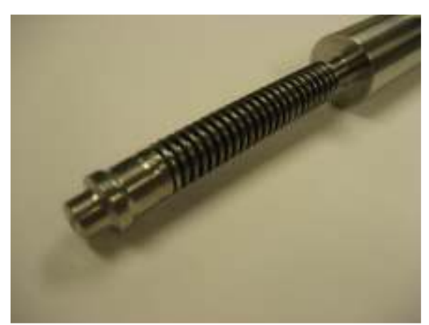
Figure 2 – GT1200-7FA Transducer

Transducers - Davidson fiber optic pressure pulsation transducers are designed for installation through the turbine casing where the existing acoustic waveguides are installed. The transducer design allows the sensor to be positioned flush with the OD of the liner. The transducer probe is flexible to accommodate movement of the liner relative to the casing.